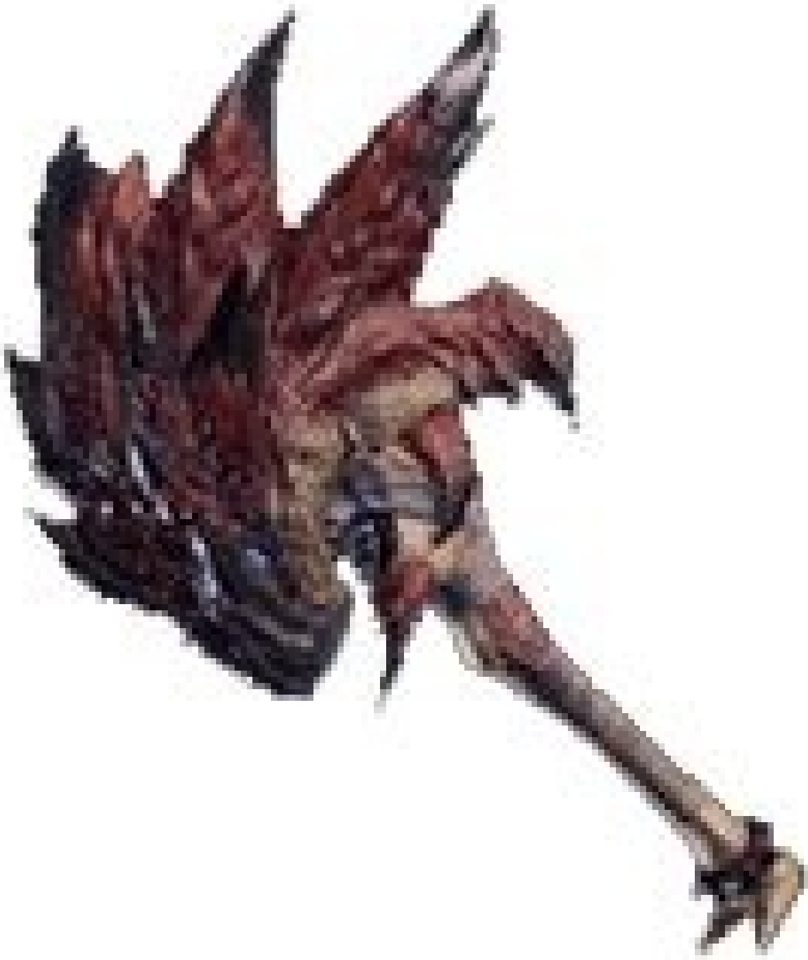
Best raw damage hammer mhw iceborne. Best ice hammer mhw iceborne. Best paralysis hammer mhw. Best charm for hammer mhw. Best ice hammer mhw. Best skills for hammer mhw. Best armor for hammer mhw. Best armor for hammer mhw iceborne.